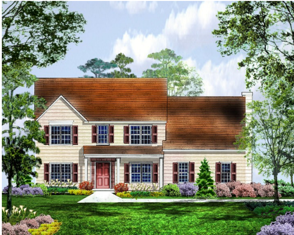
New England Elevation