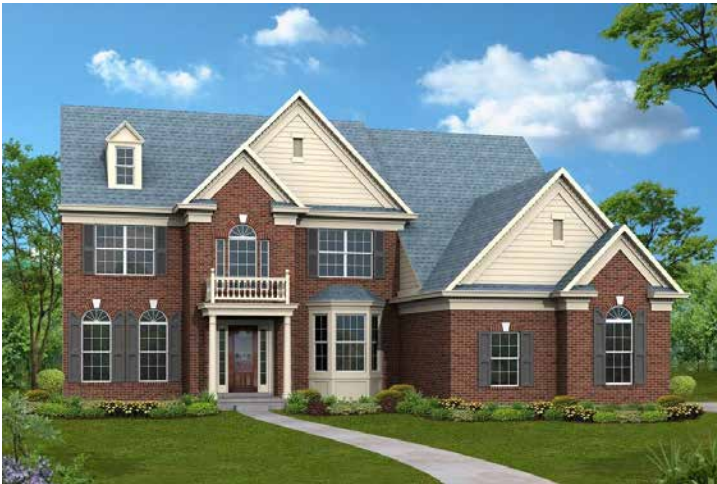
Elevation B - “The Federal”