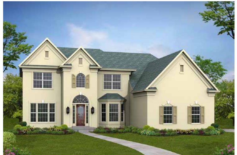
Elevation C - “The Provincial”