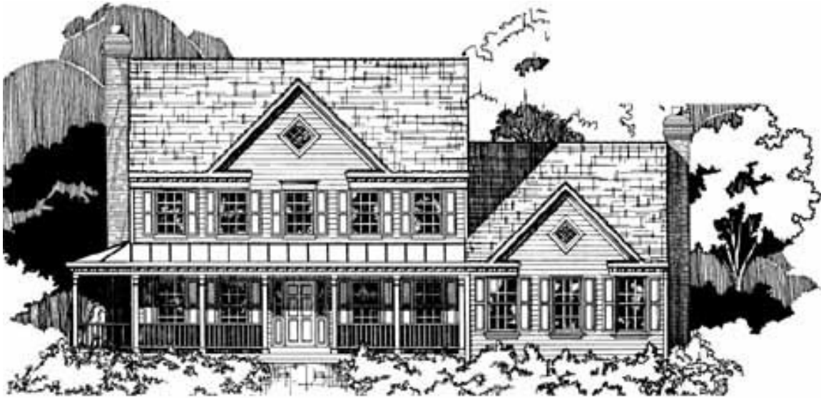
Farmhouse Elevation "B"