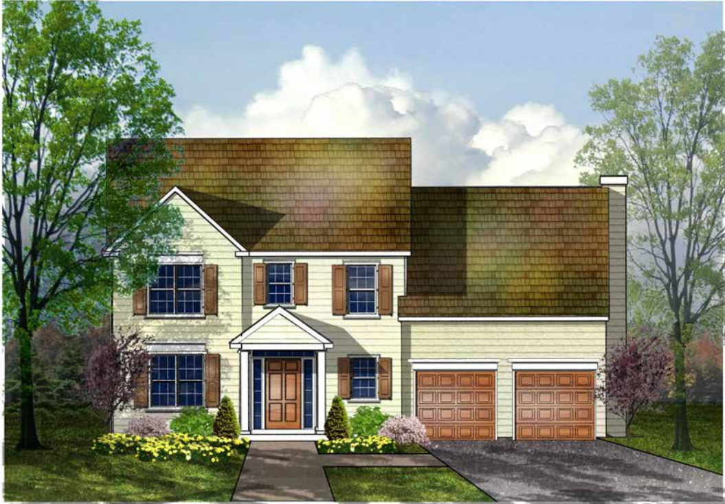
Colonial Elevation "A"