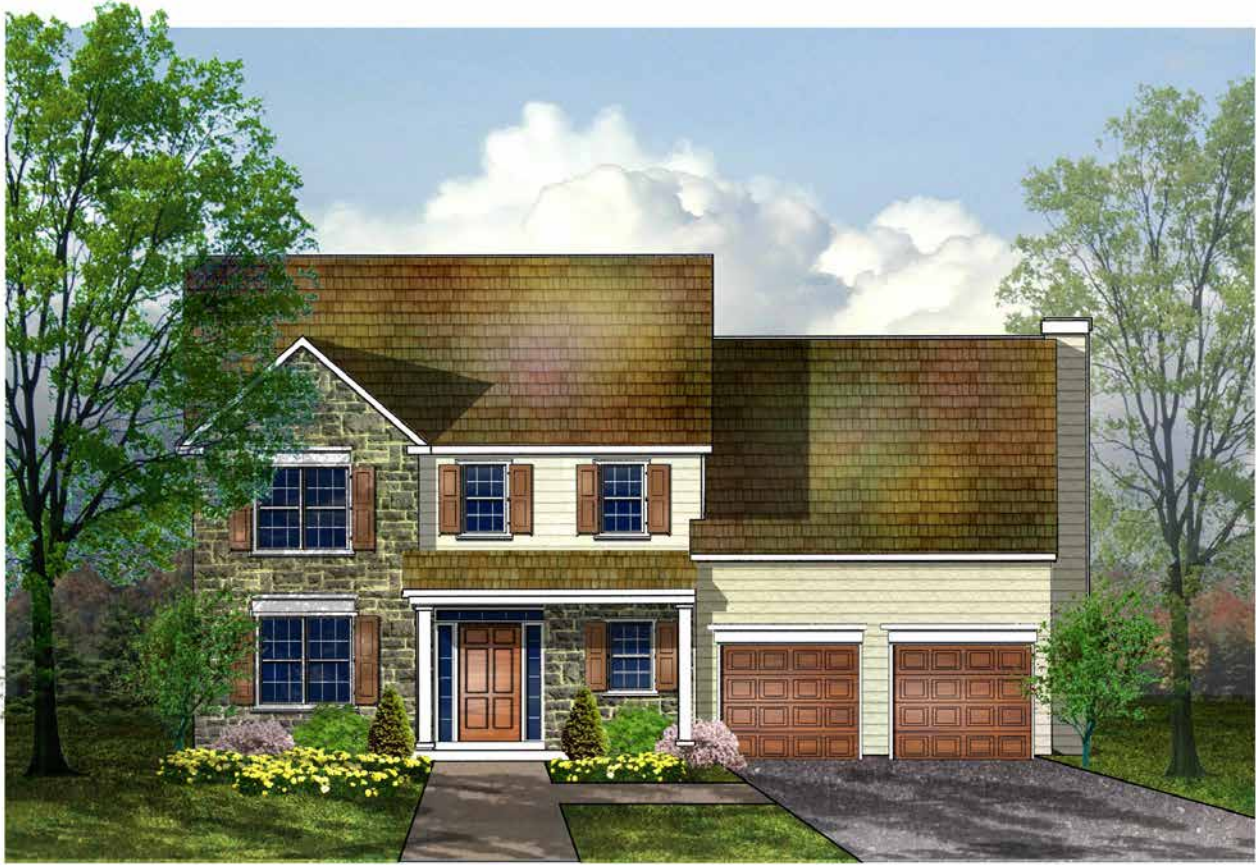
Farmhouse Elevation "C"