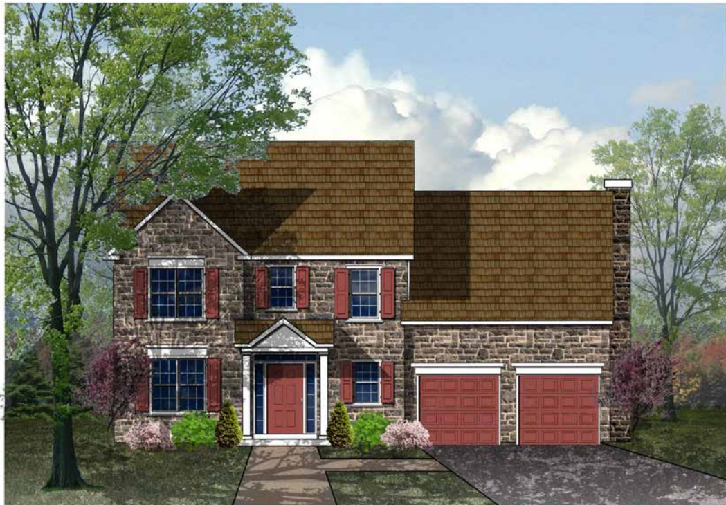
Colonial Elevation "B"